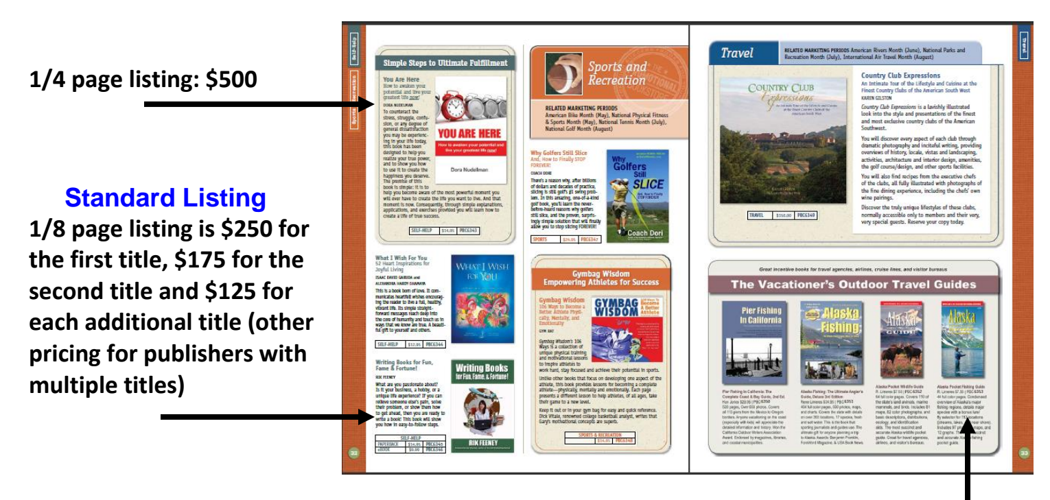
1/2 page listing: $800

In addition to the pricing below, we need 2 copies of each title to use as samples. When the reps ask for one to use in a demonstration, we individually customize it for their presentation.